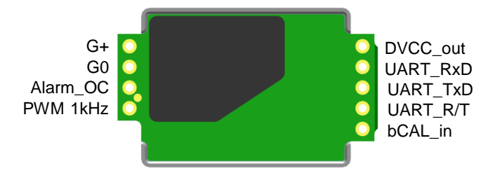
Figure 3. Pin assignment